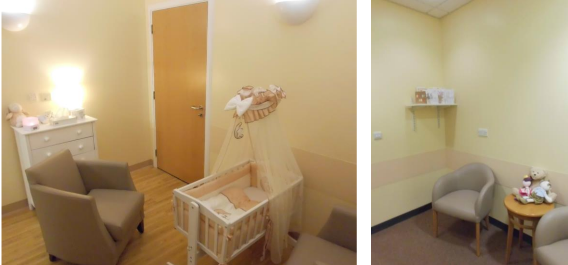
Photographs of the chapel of rest used for babies.